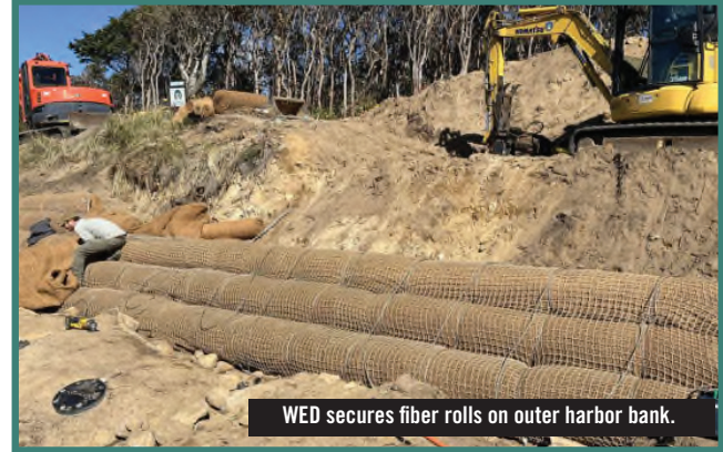
WED secures fiber rolls on outer harbor bank.